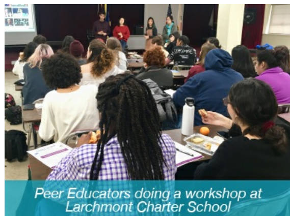
Peer Educators doing a workshop at Larchmont Charter School