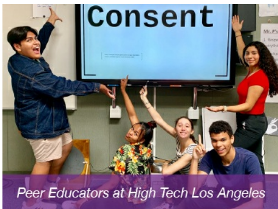
Peer Educators at High Tech Los Angeles